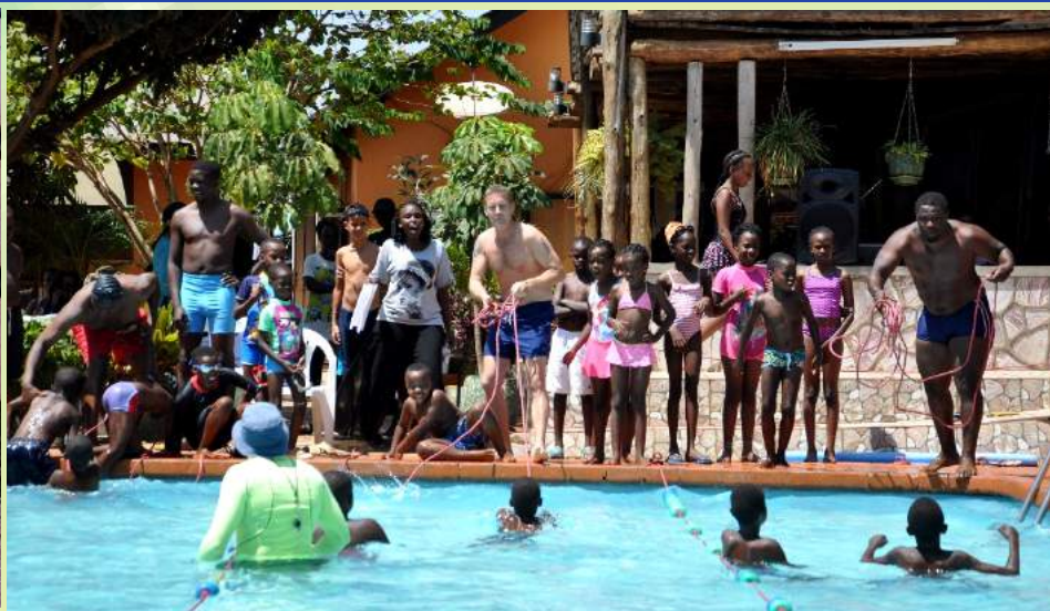
Parents play rope rescue and made it colourful