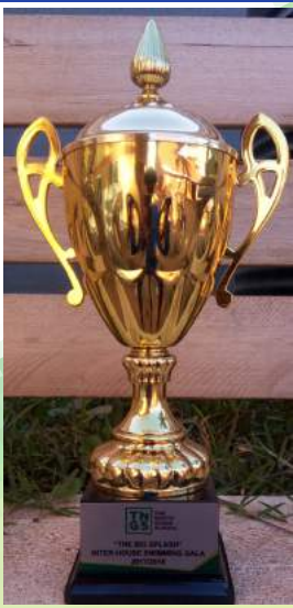
The Big Splash Trophy