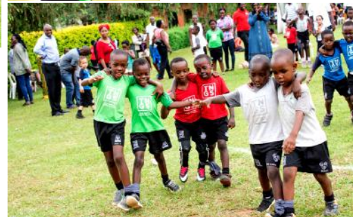
Year ones in three legged race