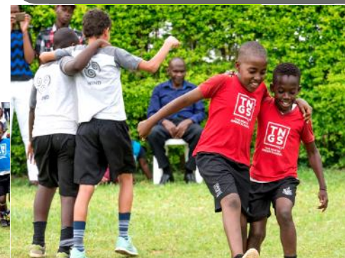
When you get the technique, everything else becomes easy and fun

It was fantastic to see so many parents supporting their children in all the different activities.