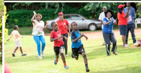
Go boys!!! Said the teachers to the athletes