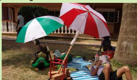
Secondary chaps on a reading picnic