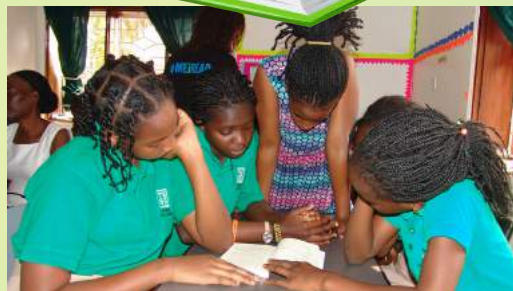
Secondary during a reading session